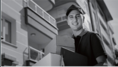
Image Capture at 0.1 Lux with IR LED.